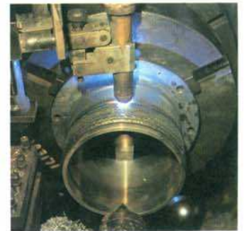
Welding up of a worn outer sleeve of a stern-tube seal by means of the Fleetworks fusion system in RDM's machine shop.