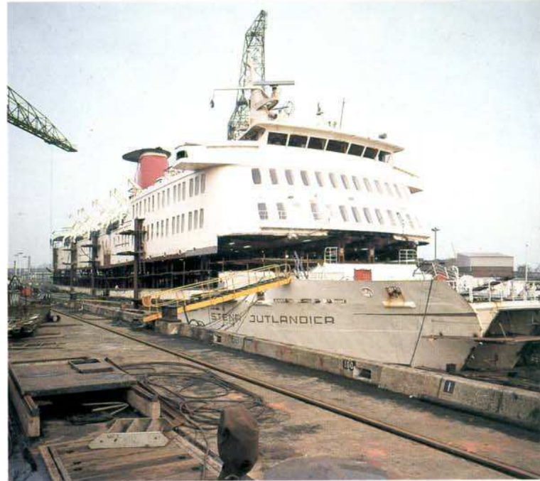
WF can glory in many successful conversions. A most imaginative example was the heightening of two Stena ferries: the ships were horizontally cut in two, followed by jacking up the entire superstructure by 2.40 metres in order to adapt the top deckspace for the transport of trailers. After lifting, the 2,000 tons' superstructure had to be fitted.