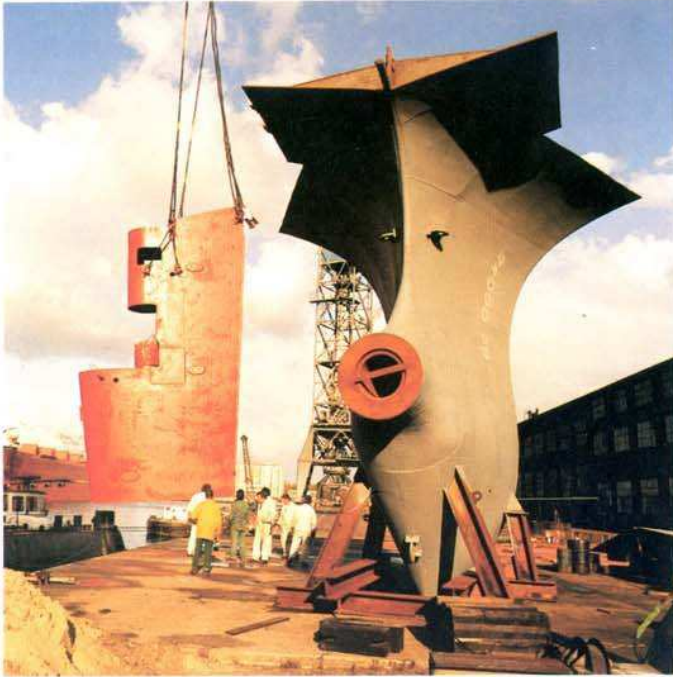
A 60 tons' section to be fitted in replacement of the rear section of a new vessel in drydock. In the background a rudder hanging in the slings of the yard's floating crane 'Mammoet' after repairs in the WF machine-shop. This rudder of a German bulkcarrier will be fitted while the ship is afloat.