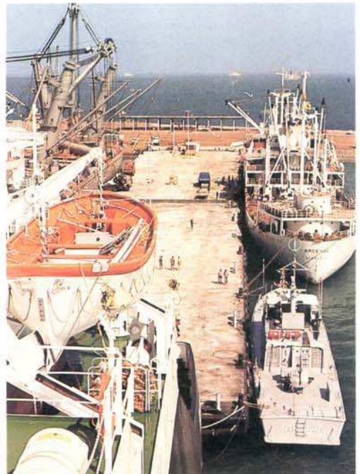
Turnkey project: this floating pier in the port of Hodeidah in the Arab Republic of Yemen was built and installed by RDM's Repair Department.