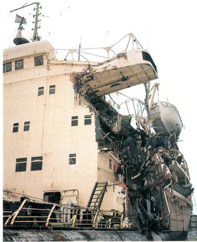
RDM repaired this collision damage in 19 days.