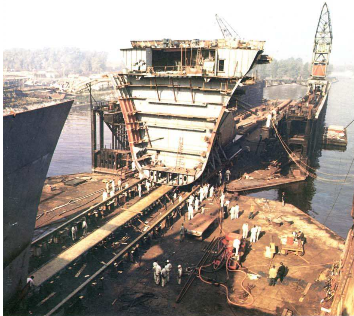
The m.v. 'Bencruachan', which had been damaged by a freak wave, was repaired at RDM. After having been repaired, the foreship was shifted from one drydock into another.