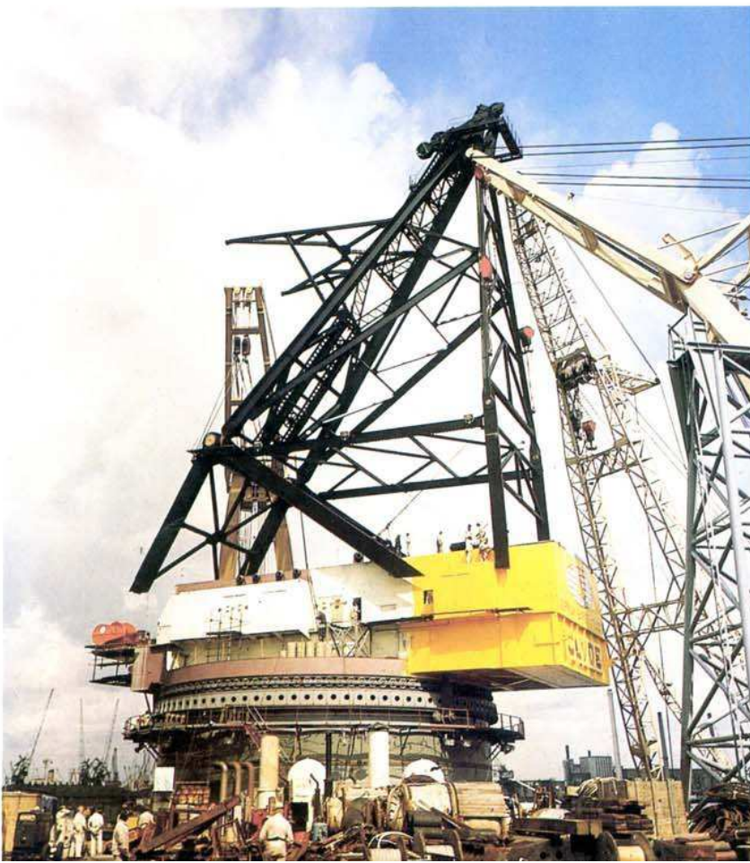
Erection of the A-frame of a heavy crane on board an offshore-barge. The tub was manufactured and machined by RDM; the crane-house and the A-frame were assembled from parts supplied by the manufacturers.