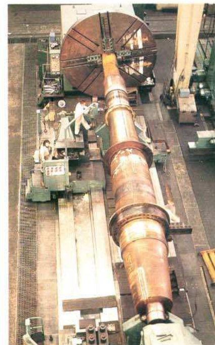
Machining a damaged rudder stock of a VLCC at the WF-RDM General Engineering Works.